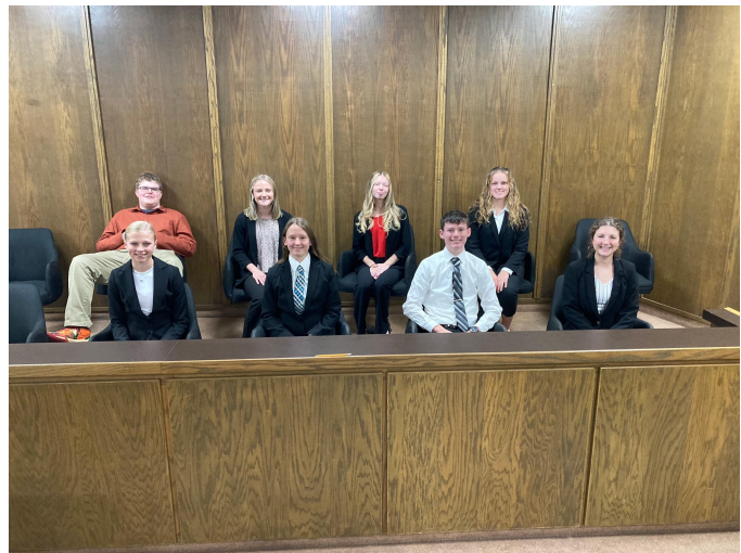
The Mock Trial Team at Districts.