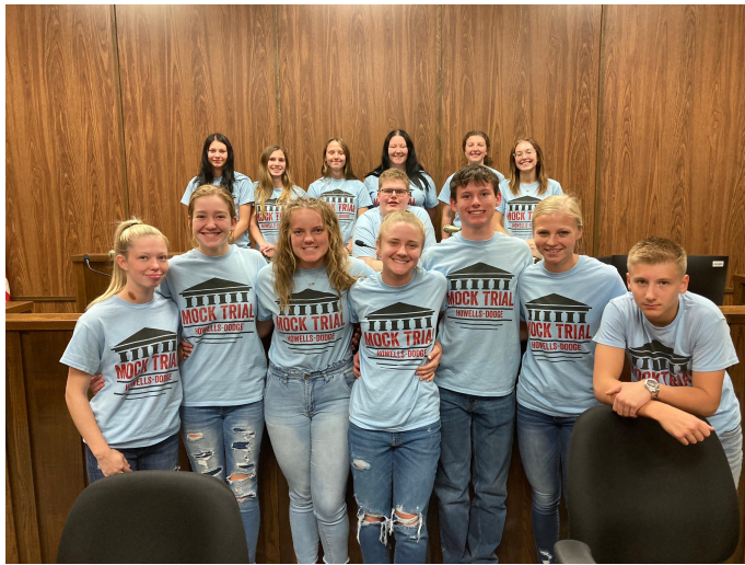
The 2022 Mock Trial Team at their Scrimmage.

The Mock Trial Team then traveled to Schuyler to perform one last time for County Government Day during the afternoon of Monday, November 14.