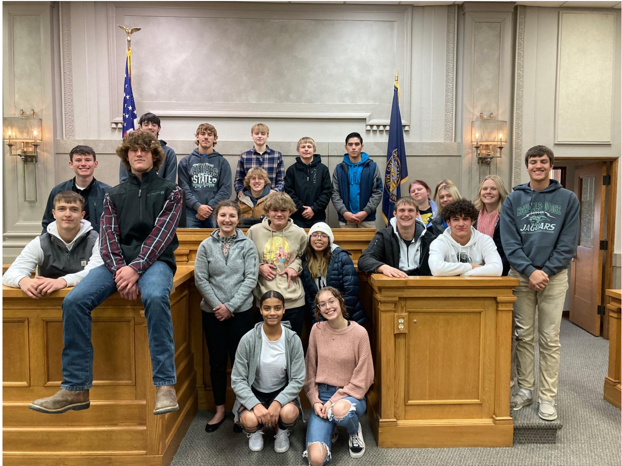
Howells-Dodge students in the American Government class participated in County Government Day on Monday November 15, 2022.